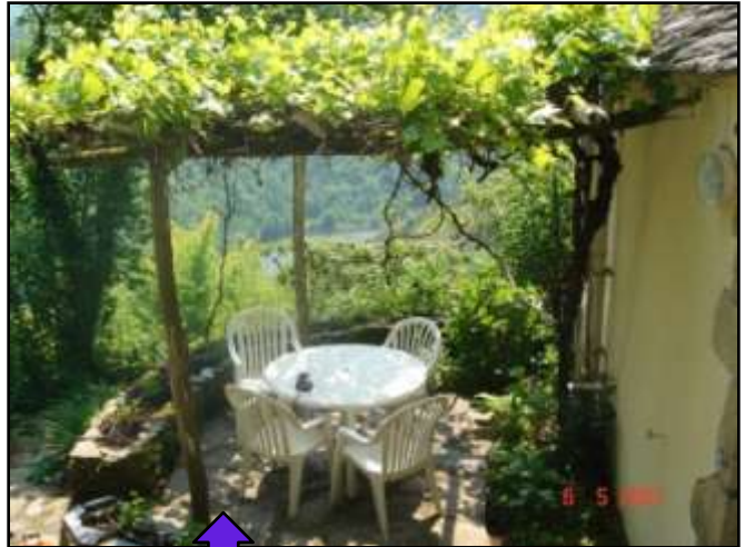
Breakfast terrace Looking down on the Lot

There are so many untouched, beautiful medieval villages to visit and so much more.