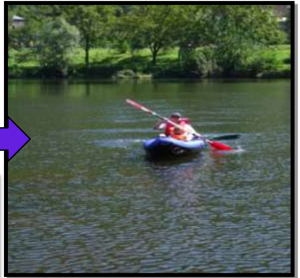
Canoeing on the Lot