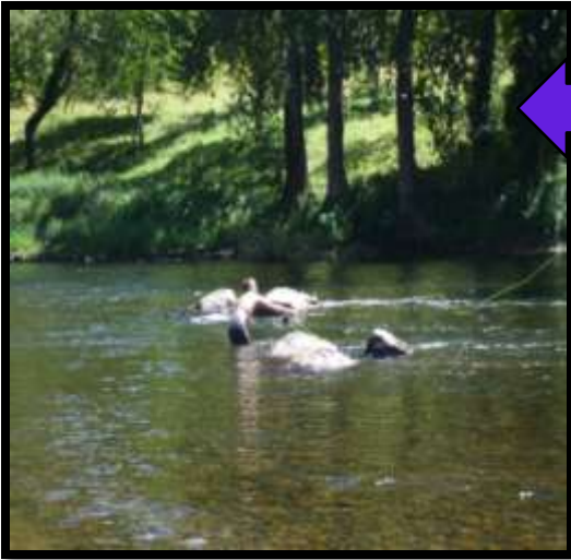
Fishing in the river Lot